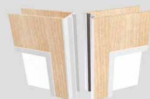
Transpalace 80 single glass