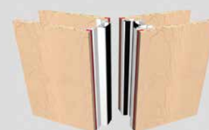
Palace 110SI EI60 inlayed edges