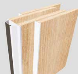
AP with edge