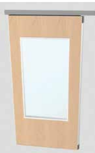
Panel with glass opening