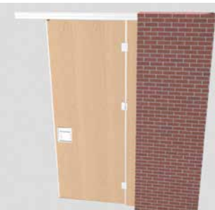
Passdoor wall fixed, full height