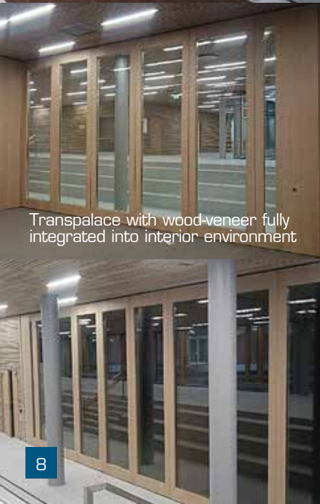
Transpalace with wood-veneer fully integrated into interior environment