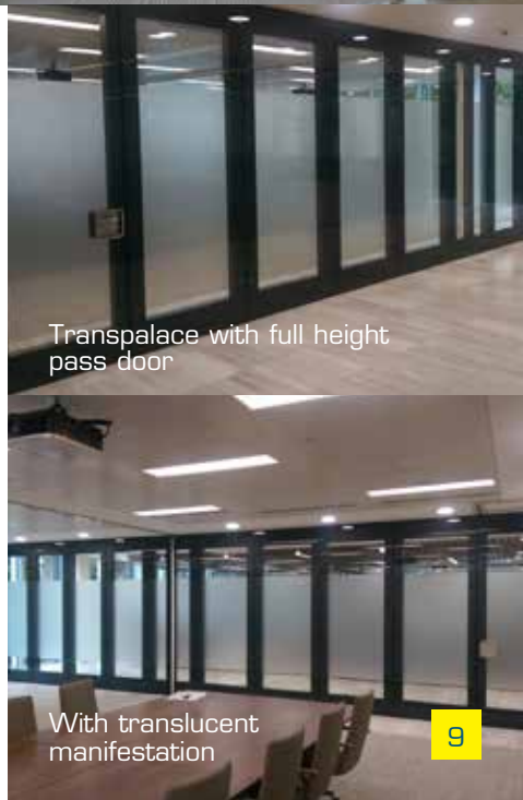
Transpalace with full height pass door

In addition, manifestation and inscriptions can be applied to the inside or outside of the glass, allowing extra durable functionalities to be added to the mobile glass partition. The glass can also be engraved, sandblasted, digitally printed and screen-printed. 'Smart glass' can also be applied!