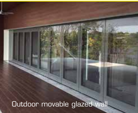
Outdoor movable glazed wall

By using a Transpalace partition, you create an open and bright environment, while retaining high acoustic insulation and the contemporary functional design.