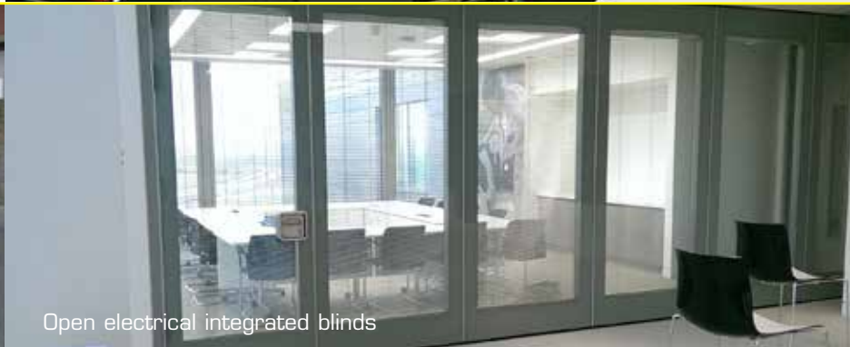
Open electrical integrated blinds