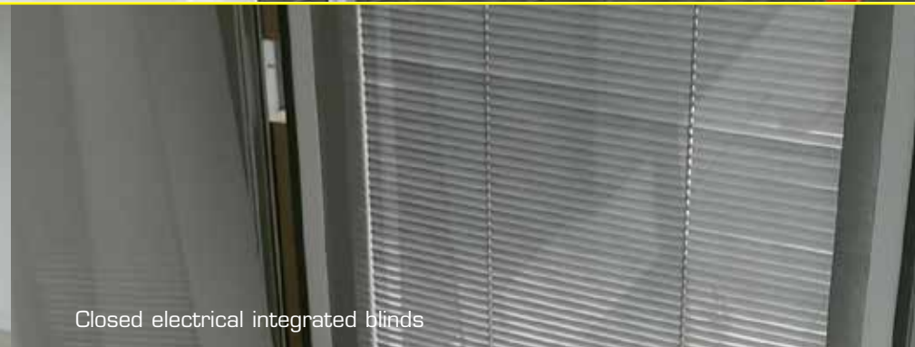
Closed electrical integrated blinds